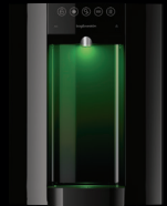
Black - Countertop