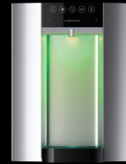
Silver - Countertop