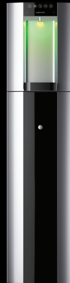
Silver - Floorstanding